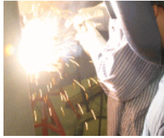
The College of the Mainland recently hosted its COM... June 26, 2015