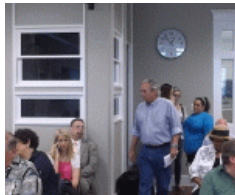
Galveston City Council on Thursday voted unanimously... June 26, 2015