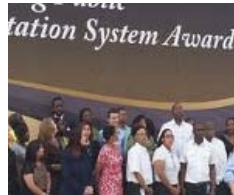
The Metropolitan Transit Authority of Harris County... June 25, 2015