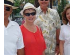
The Bryan Museum in Galveston has provided a photo... June 26, 2015