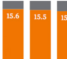
Rice University's Baker Institute for Public Policy... June 26, 2015