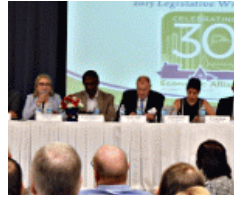
The Economic Alliance Houston Port Region on Wednesday... June 26, 2015