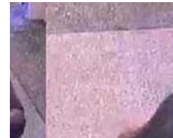
The Metropolitan Transit Authority of Harris County... June 25, 2015