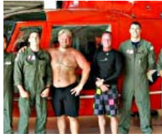
The United States Coast Guard on Saturday rescued two... June 28, 2015